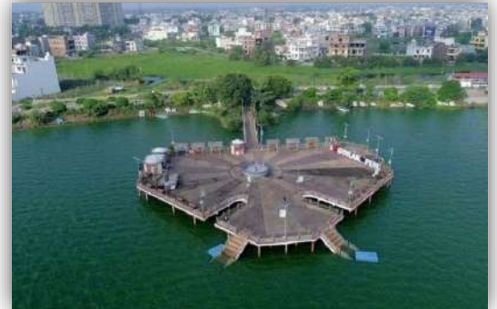
Ramgarh Tal Lake

Ramgarh Tal is a beautiful and expansive lake located near the city, offering scenic views and a peaceful environment. It is a popular spot for boating, picnics, and evening walks. The lake area has been developed with parks and recreational facilities, making it a favorite destination for both locals and tourists who want to relax in nature.