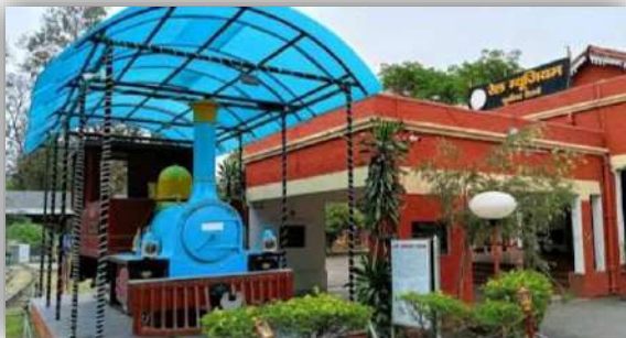
Gorakhpur Rail Museum & City Attractions

Gorakhpur offers several attractions like the Rail Museum, Planetarium (Taramandal), and vibrant local markets. The Rail Museum showcases vintage locomotives and the history of Indian Railways, making it an educational and fun place to visit. Along with parks and cultural spots, these attractions highlight the blend of history, science, and modern lifestyle in the city.