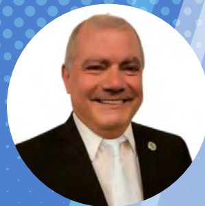
Grand Master Abelardo Benzaquén