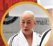
GRANDMASTER UNG KIM-LAN