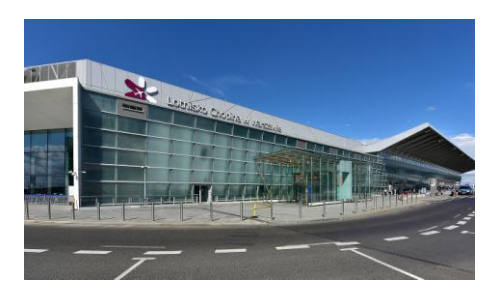
WARSAW CHOPIN AIRPORT – 165 km from Lublin – 1,40 minutes to Lublin

https://www.lotnisko-chopina.pl/en/index.html