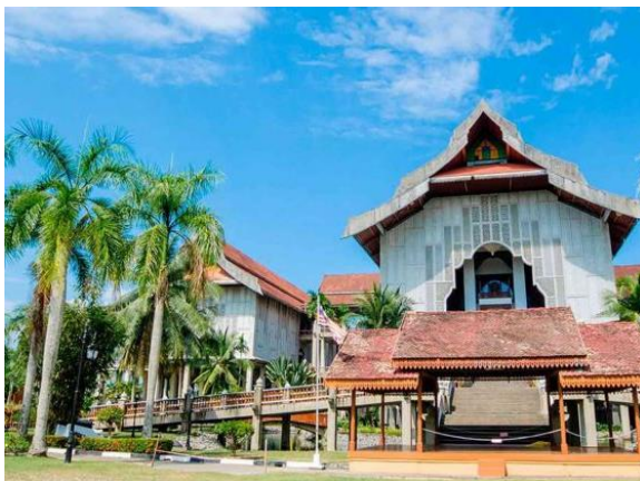
TERENGGANU STATE MUSEUM

A grand mosque made of steel, glass and crystal. Located at the Islamic Heritage Park on the island of Wan Man, 8km away from Grand Puteri.