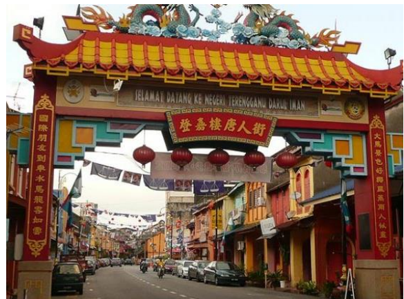
CHINATOWN KUALA TERENGGANU

Largest museum in Southeast Asia, inspired by traditional houses showcasing Malaysian history. Located about 7km away from Grand Puteri.