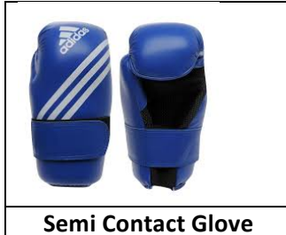
Semi Contact Glove