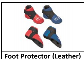
Foot Protector (Leather)