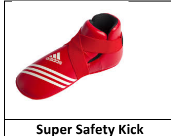
Super Safety Kick