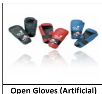
Open Gloves (Artificial)