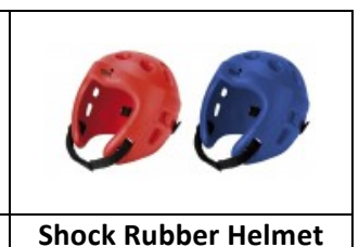
Shock Rubber Helmet