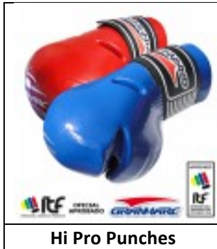
Hi Pro Punches