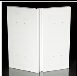
Re-Breakable Board White (Soft Difficulty)