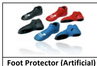
Foot Protector (Artificial)