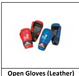
Open Gloves (Leather)