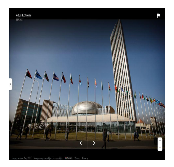
AFRICAN UNION HEAD OFFICE