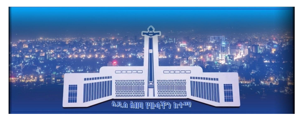
ADDIS ABABA CITY ADMINSTRATION MUNICIPAL